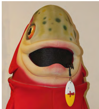
Charly The Char Recreational Sport Fishing Mascot